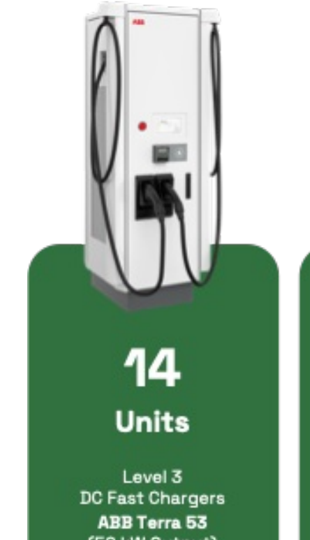
ABB Terra 53 (50 kW Output)

Fully Connected design, supporting both CCS and CHAdeMO standards.